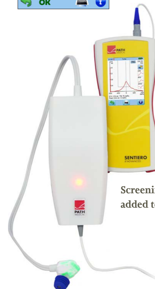
Screening and diagnostic Tympanometry can be added to Sentiero Advanced with the TY-MA